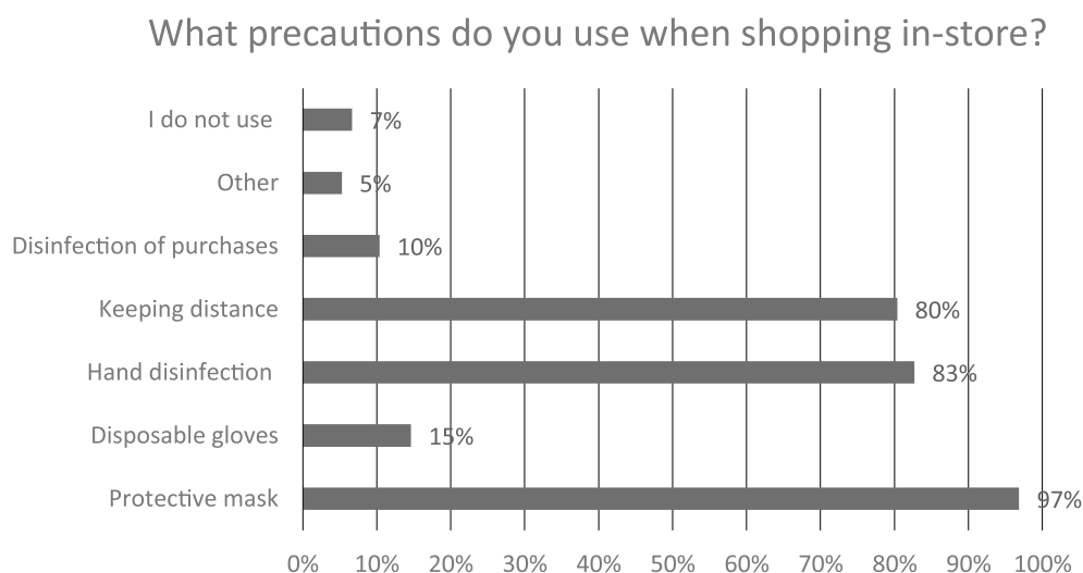
Figure 3. Precautions taken by respondents

with increase of COVID-19 cases. Other respondents (n=505; 47%) did not see such a dependence.